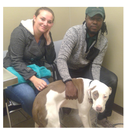
Chino | March 2019