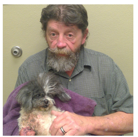
Dakota | February 2019

One of our core commitments is to never turn away a critically ill pet for financial reasons. Our hospital and clinic are located in low-income areas of Jacksonville. Even with our low-cost, high-volume model and our full range of accessible payment plans, some clients simply cannot afford to pay for care. All too often in traditional veterinary practices, economic euthanasia is the only option; we will not allow that to happen.